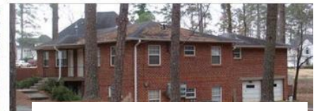
2,021 Sq. Ft Duplex