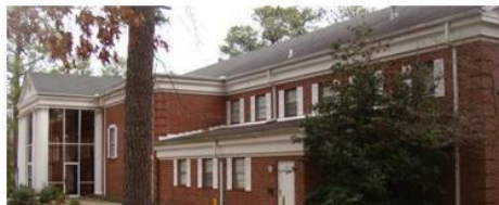
8,363 Sq. Ft Gym & Apt