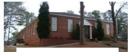
5,830 Sq. Ft Dorm