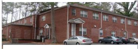
16,156 Sq. Ft. Dorm