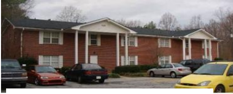
10,368 Sq. Ft Apt