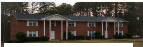
10,368 Sq. Ft Apt