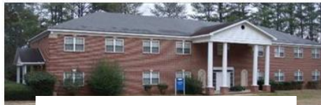
10,500 Sq. Ft Dorm