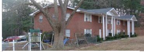
10,368 Sq. Ft Apt