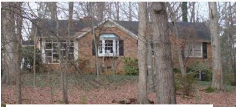
2,100 Sq. Ft Apt