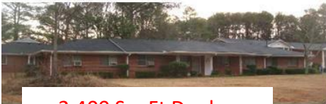
2,400 Sq. Ft Duplex