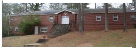
7,500 Sq. Ft Dorm