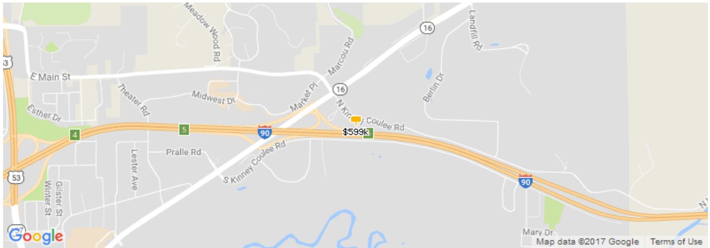
Legend: 🏠 Subject Property