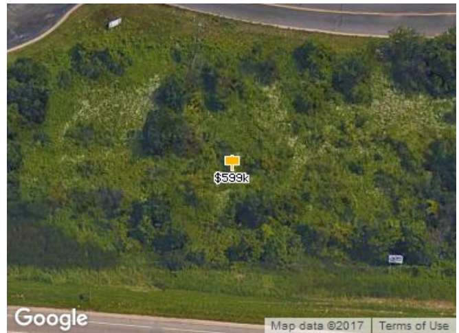
Legend: 🏠 Subject Property