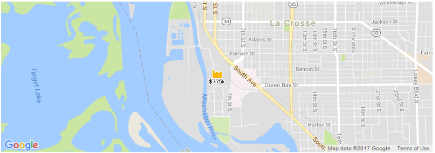
Legend: 🏠 Subject Property