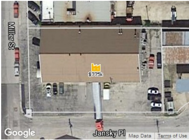
Legend: 🏠 Subject Property