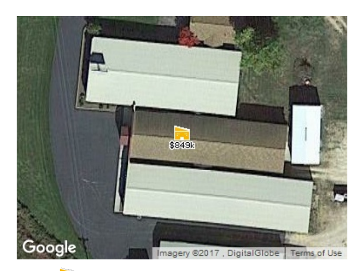
Legend: Subject Property