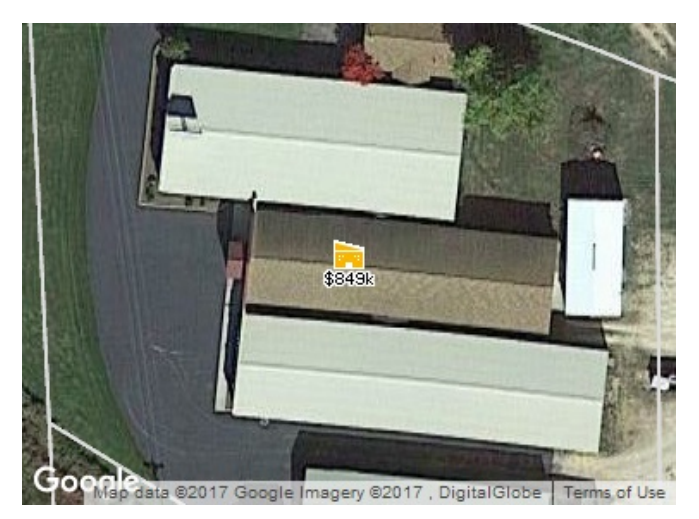
Legend: Subject Property