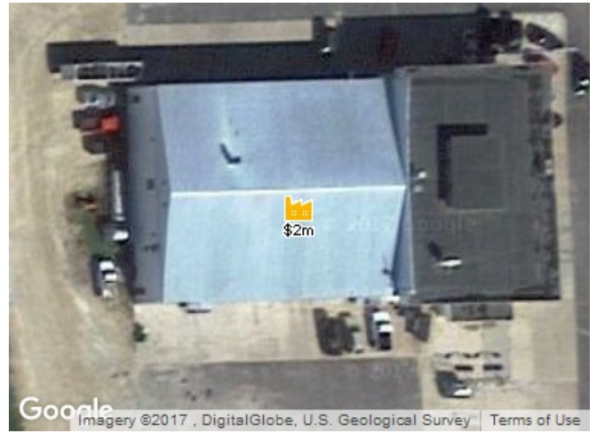
Legend: 🏠 Subject Property