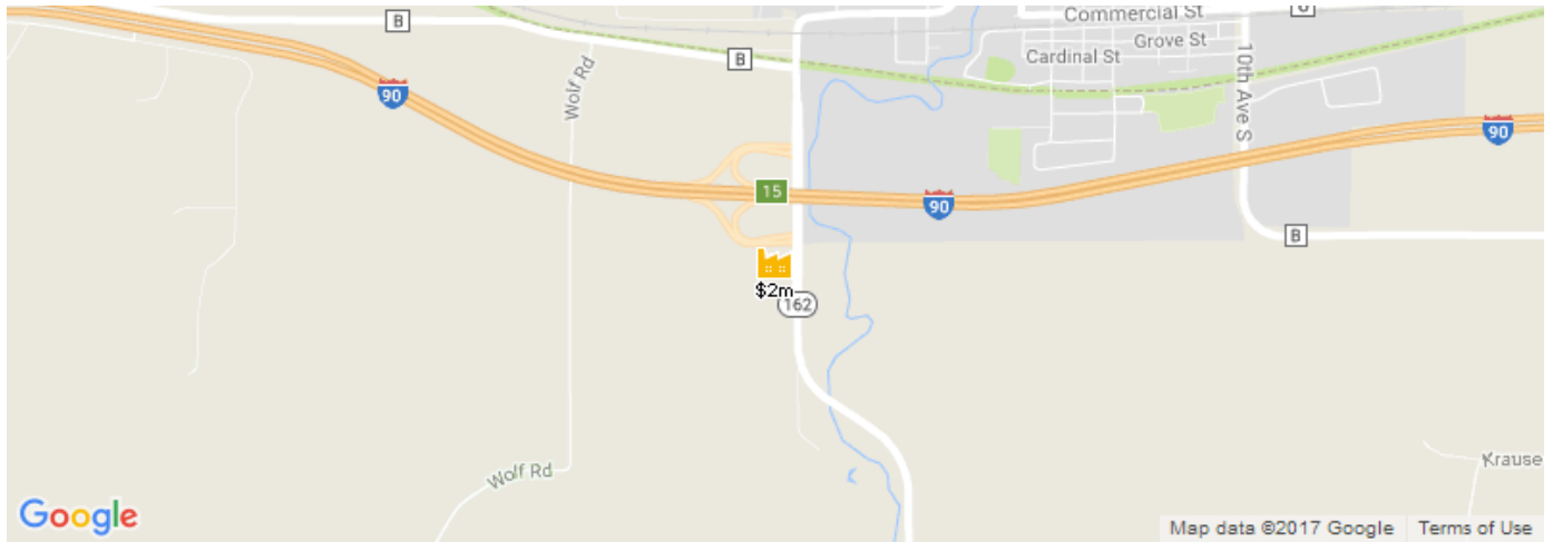
Legend: 🏠 Subject Property