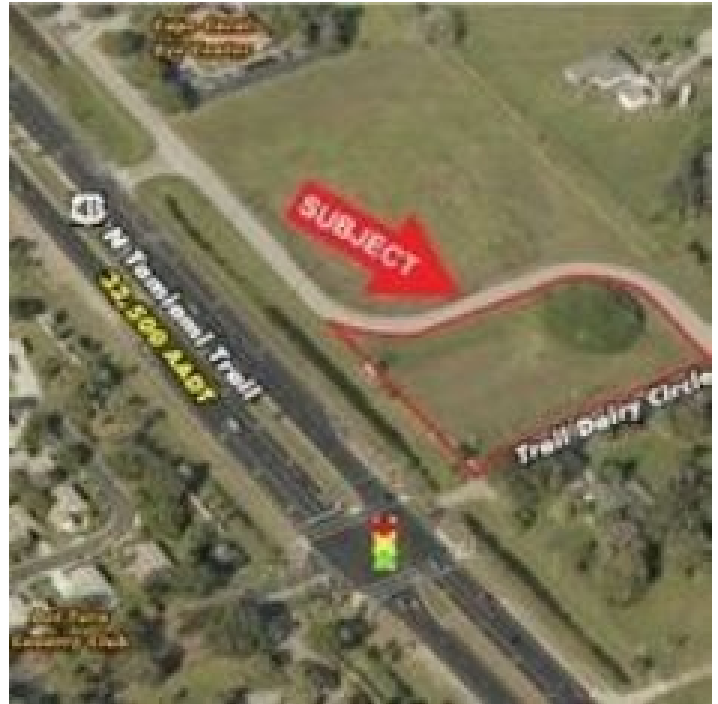
18700 N Tamiami Trl