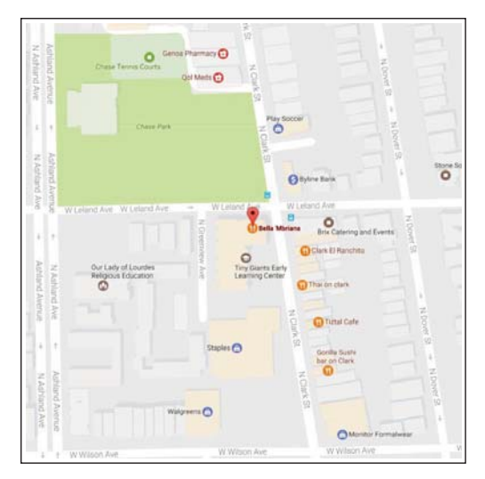
Clark St. & Leland Ave.

No representation is made as to the accuracy of this information and it is submitted subject to errors omissions, prior sale or withdrawal without notice. 1017 10-30-2012