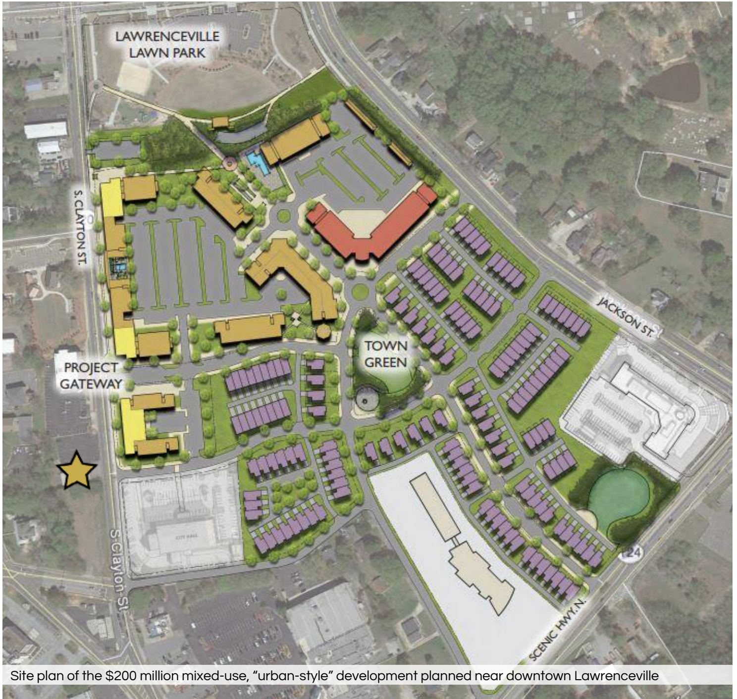
Site plan of the $200 million mixed-use, "urban-style" development planned near downtown Lawrenceville