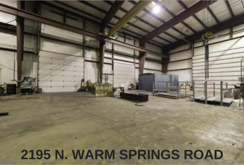
2195 N. WARM SPRINGS ROAD

2195 & 2211 N. WARM SPRINGS ROAD SALT LAKE CITY, UTAH 84116