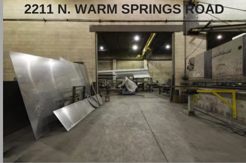
2211 N. WARM SPRINGS ROAD