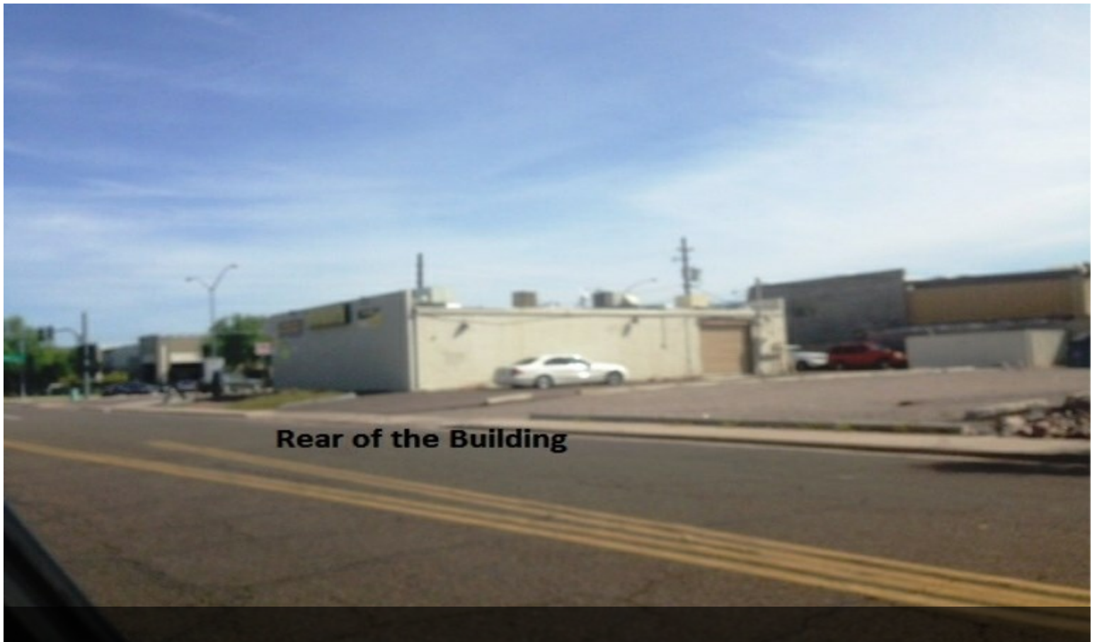
Rear of the Building