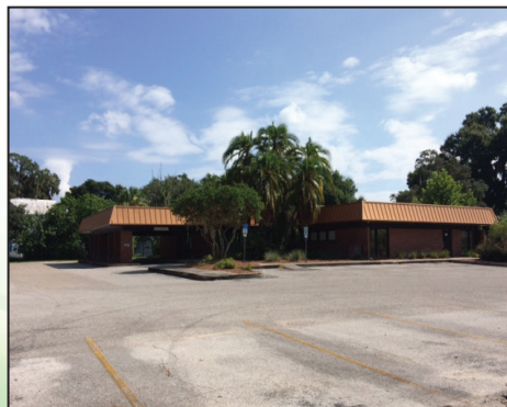
Parking Lot View