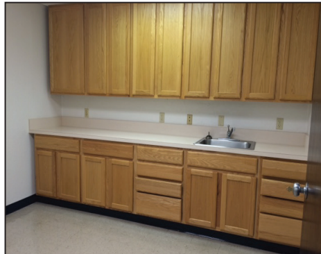
Conference / Breakroom