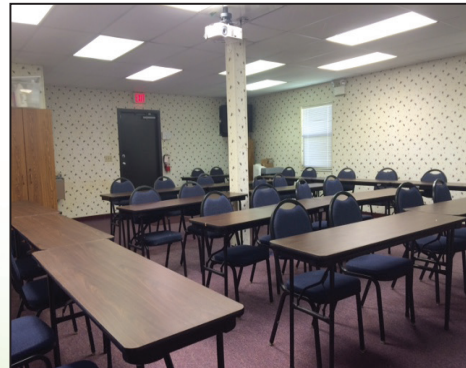
Annex Training Room

DISCLAIMER: Information contained herein is from sources deemed reliable, but not verified and no warranty is made as to the accuracy thereof. This offering is made subject to errors. Omissions, change of price or other conditions, prior sale or lease or withdrawal without notice. Prospective buyers/ tenants are encouraged to verify, independently, all pertinent data. The Mahoney Group, Inc. 3825 S. Florida Avenue, Suite 5, Lakeland, Florida 33813 is the agent of and represents the Owner/Landlord of this property.