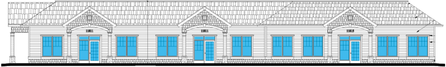
FRONT ELEVATION (WEST)

Illustrations are for conceptual purposes. Sale is for land only.