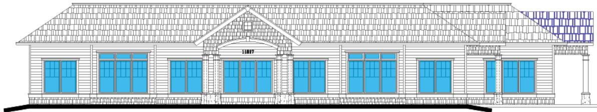
65th STREET ELEVATION (NORTH)