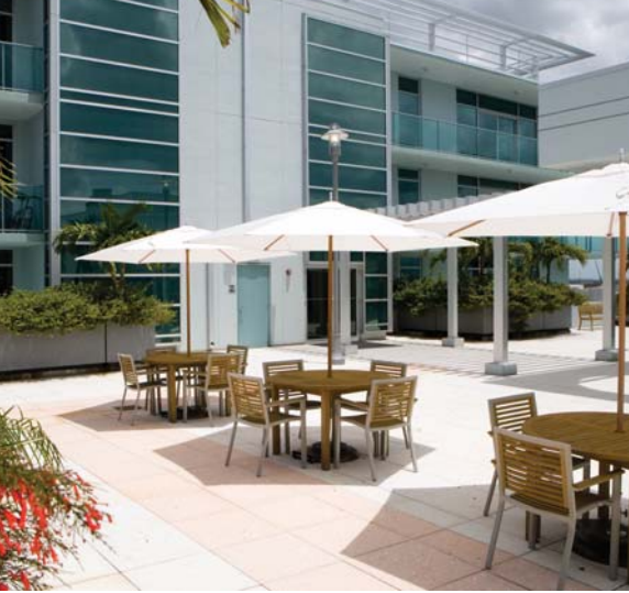
THE PLACE AT CHANNELSIDE CONDOMINIUM