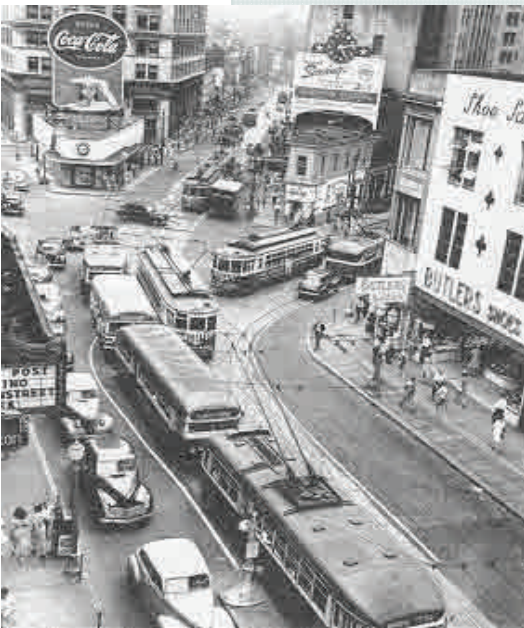
Circa 1940– Peachtree and Auburn Avenue