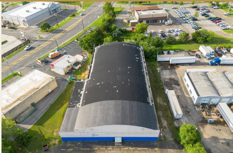
AERIAL VIEW — ±21,000 SF BUILDING