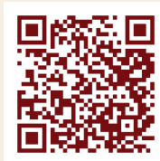
SCAN FOR PROPERTY LISTING