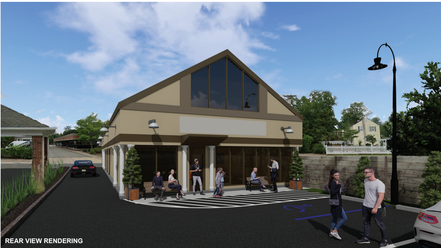
REAR VIEW RENDERING

NewmarkRealEstate.com | 973.884.4444 | 7 E. Frederick Place Suite 500 Cedar Knolls New Jersey 07927