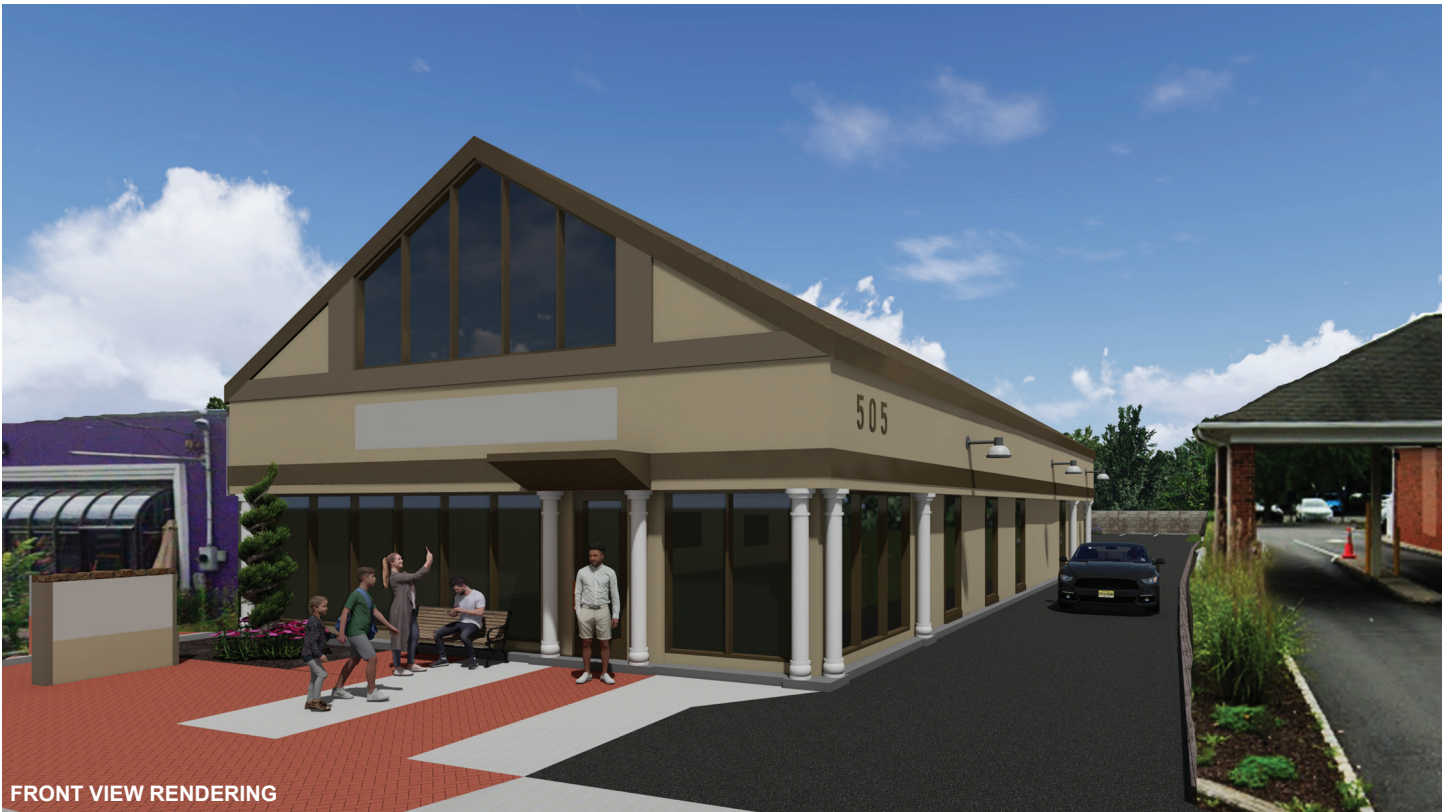
FRONT VIEW RENDERING