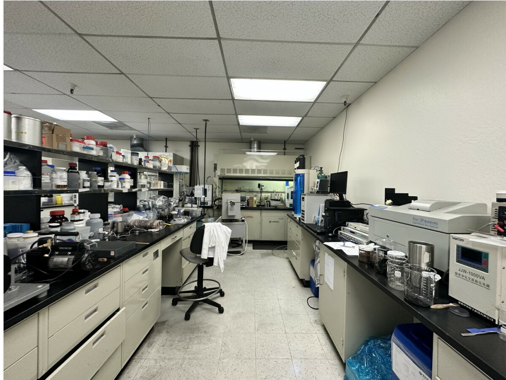
4-Hood 1-MidRange View