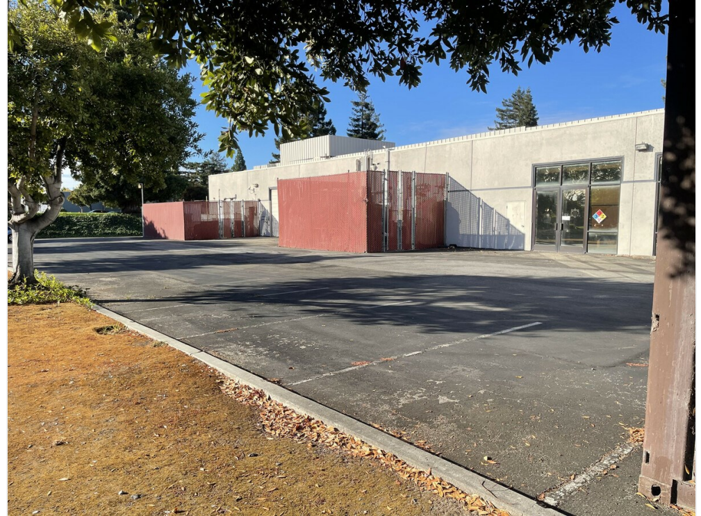
unnamed (27) (1)