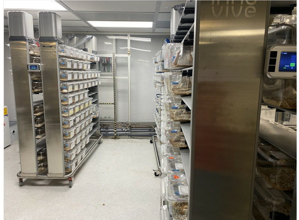
Animal Room Photo 2