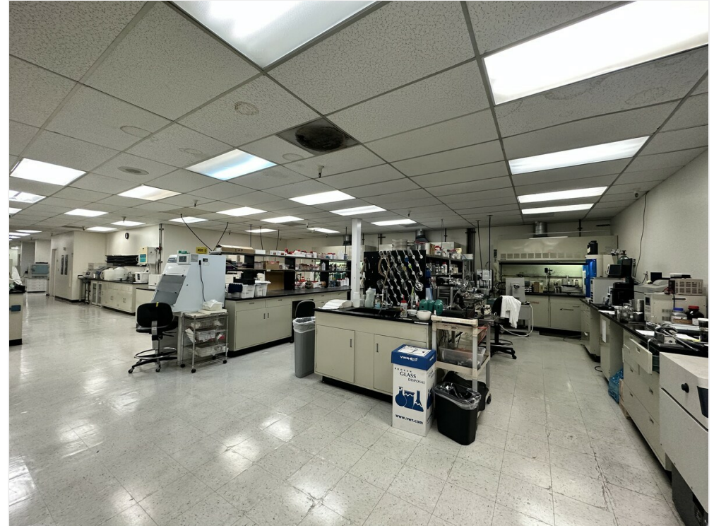
2-Far View of Middle Hood and Shatanu hood (from left to right)