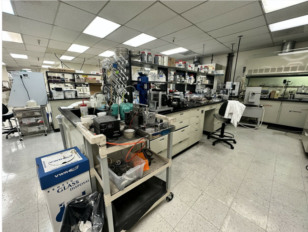
2- Hood 1-LeftSide View