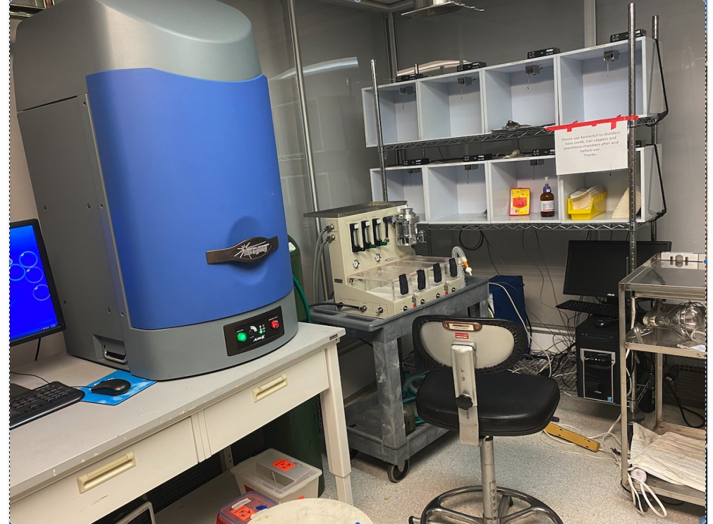
Procedure Room 4