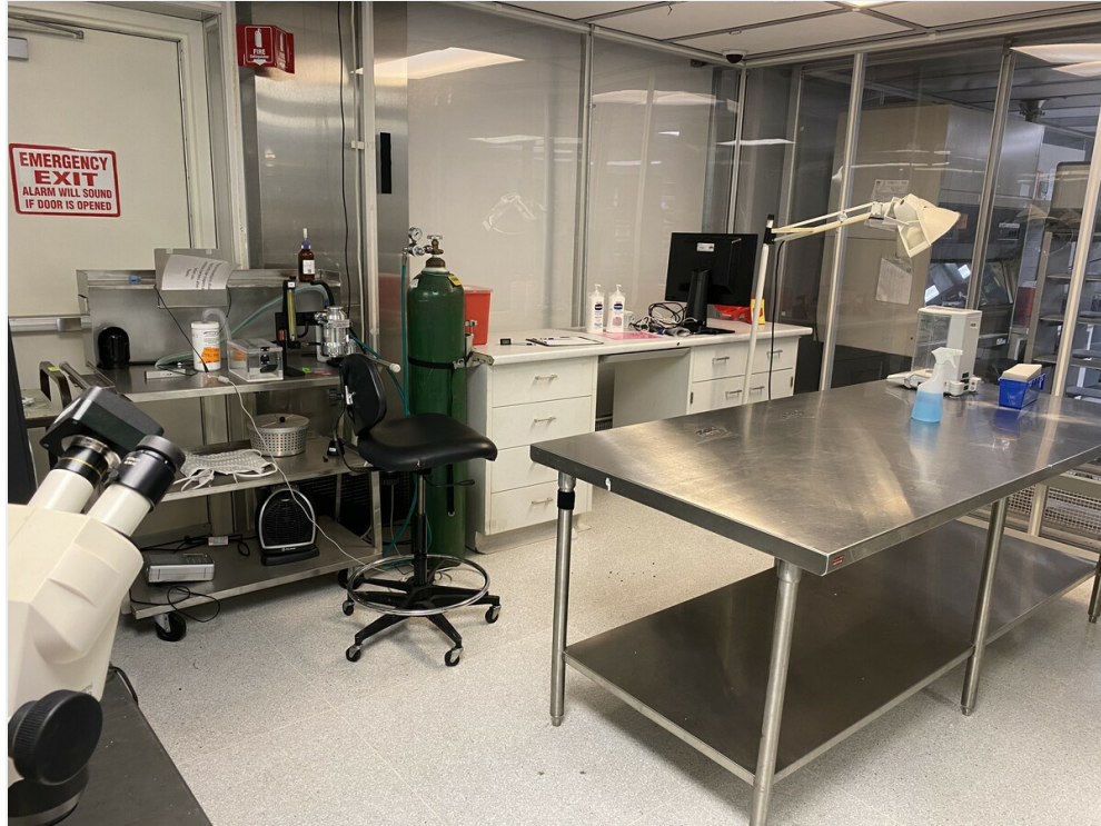
Procedure Room 1