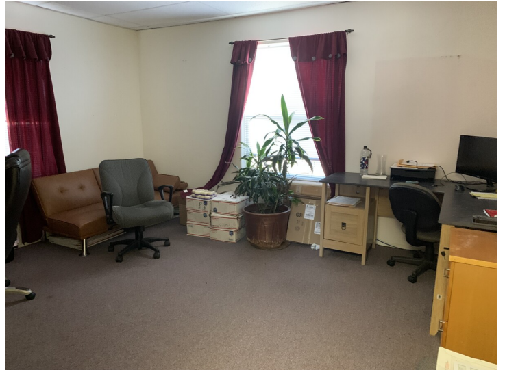
Mortgage Broker's Office