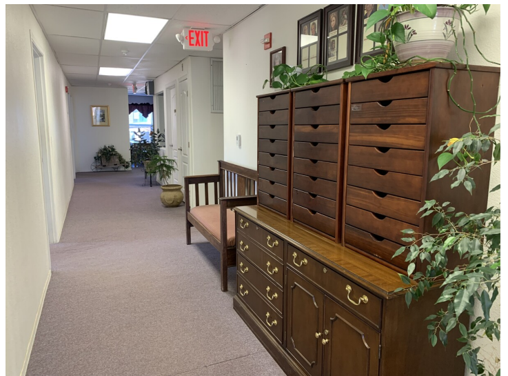
Hallway facing north