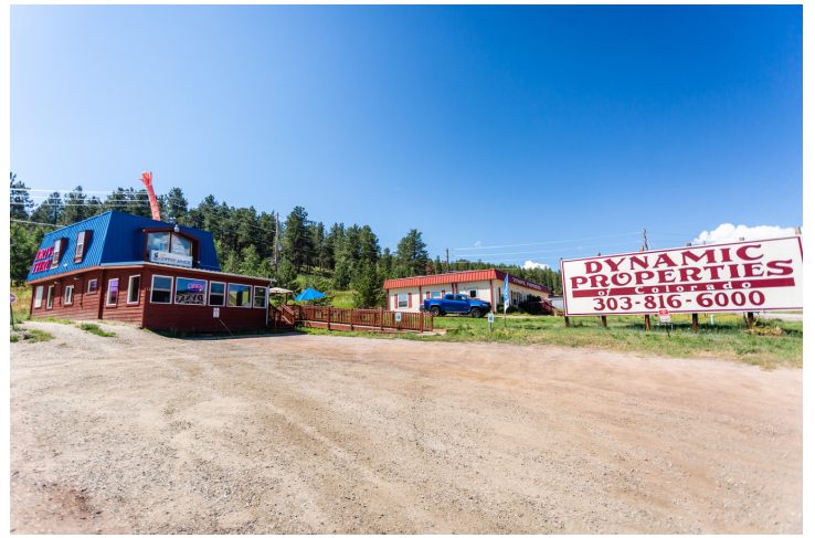
Both Buildings and Billboard