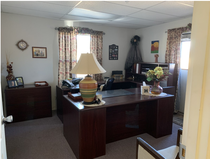
Broker's Office w/Outside Entrance