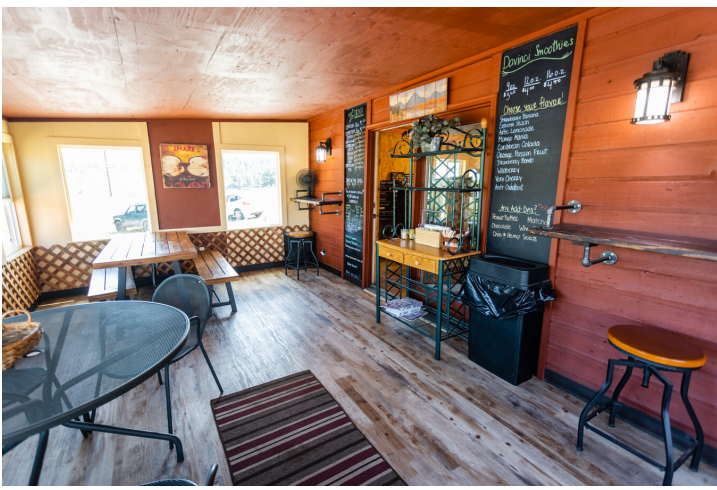
Coffee Shop Sunroom