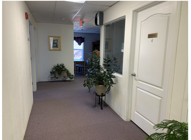
Hallway - Conference Rm on right