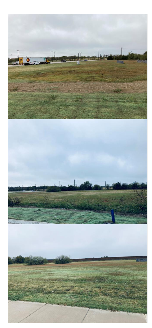
Information Deemed Reliable, but not Guaranteed. Copyright: 2021 NTREIS.