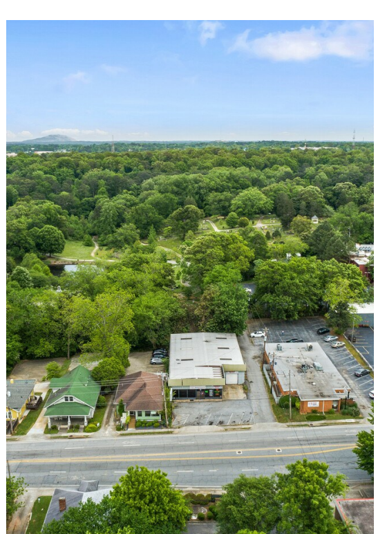
803 Church St 803 Church St, Decatur, GA 30030