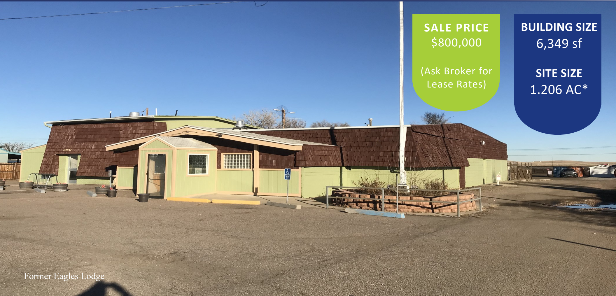
Former Eagles Lodge

6,349 sf improved space on 1.206 Acres* (C-3 Zoning)