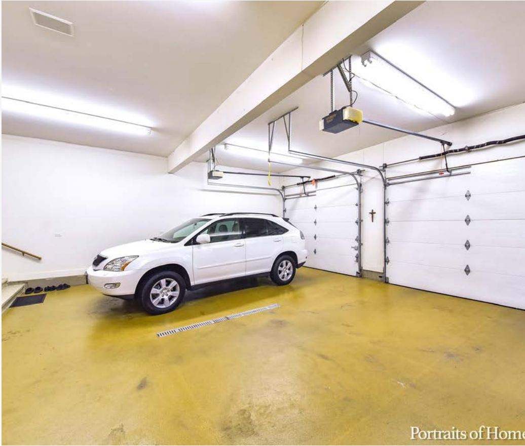
Portraits of Home