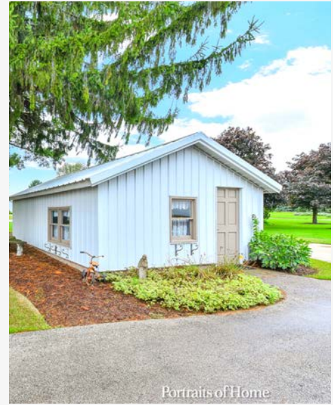
Portraits of Home