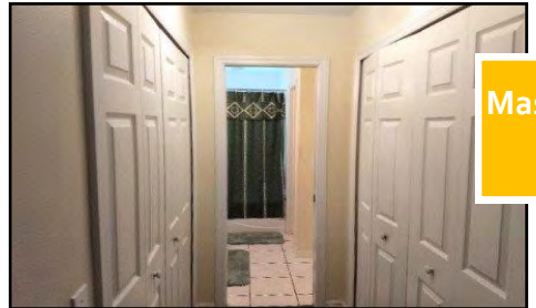
Master Bedroom Closet