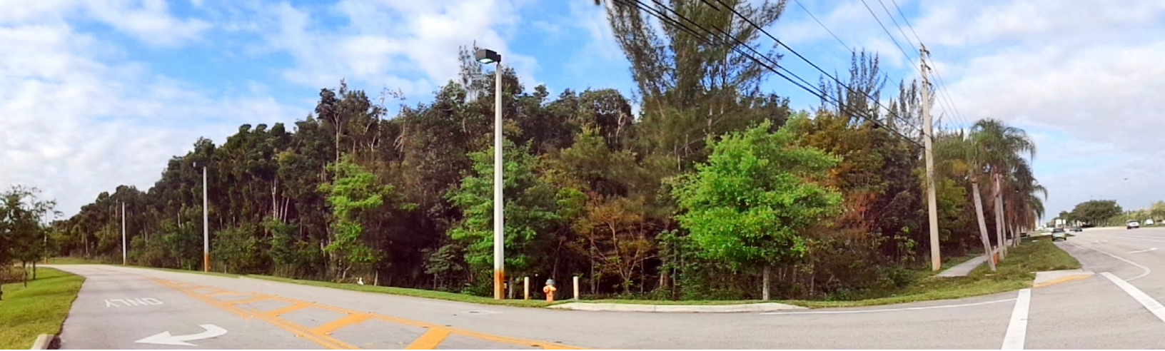
19000 Pines Blvd, Pembroke Pines, FL 33029