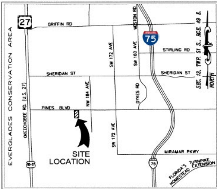
LOCATION MAP (N.T.S.)