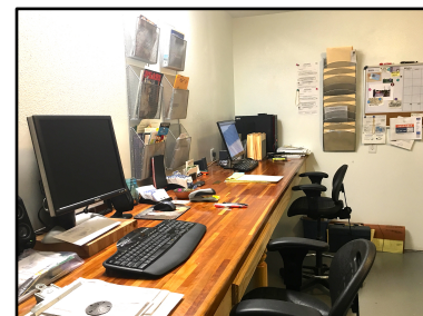
900 sq. ft. office space