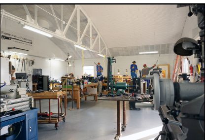
1800 sq. ft. open shop