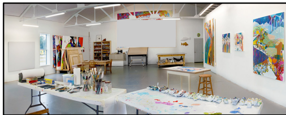
2400 sq. ft. open shop