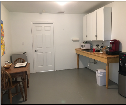
Kitchen area with new fixtures and plumbing