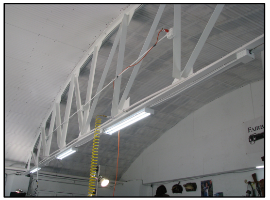
All LED lighting in both open shops

1800 sq. ft. shop 5 ton AC unit 2400 sq. ft. shop 5 ton AC unit 900 sq. ft. office 3 ton AC unit