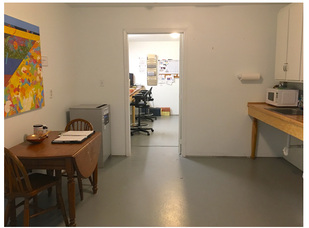
Kitchen area adjoining office