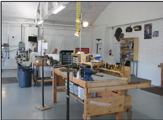
1800 sq. ft. open shop