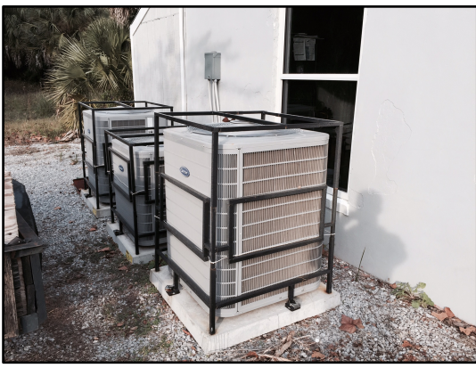
Carrier 16 Seer 2 Stage

1800 sq. ft. shop 5 ton AC unit 2400 sq. ft. shop 5 ton AC unit 900 sq. ft. office 3 ton AC unit