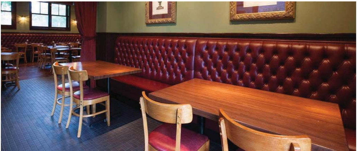
Club Room / Back Dining Room