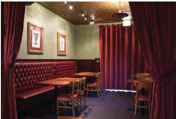
Club Room - Private Party Dining