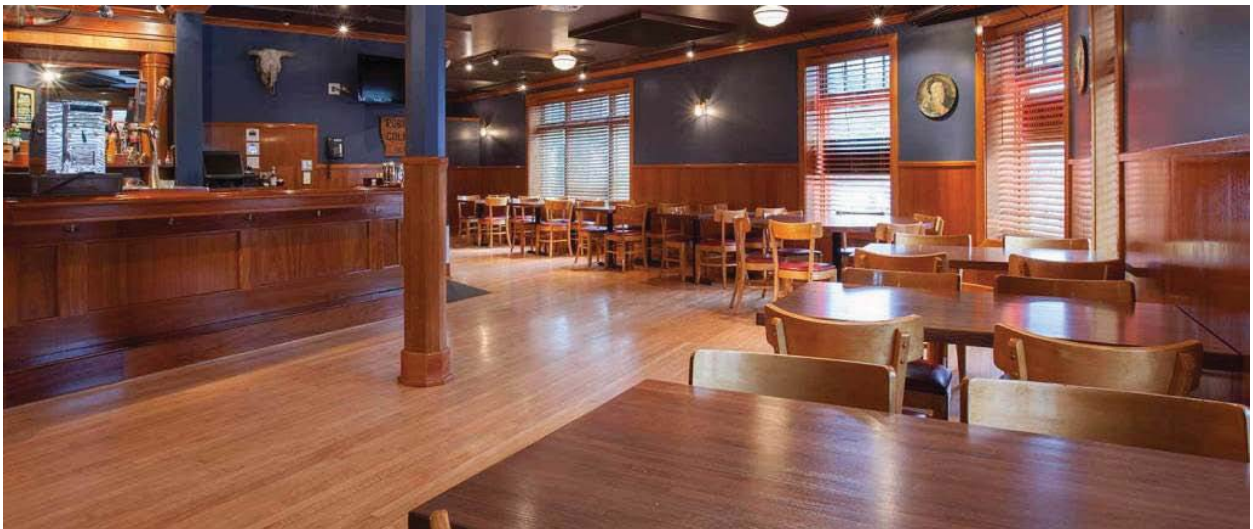
Upstairs Private Party Room