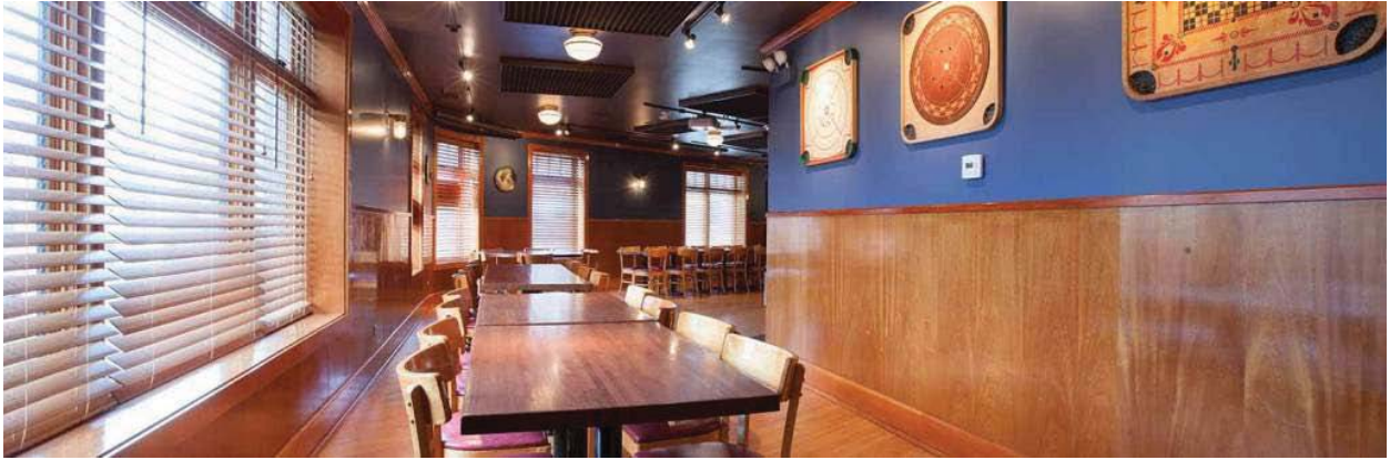
Upstairs Private Party Room