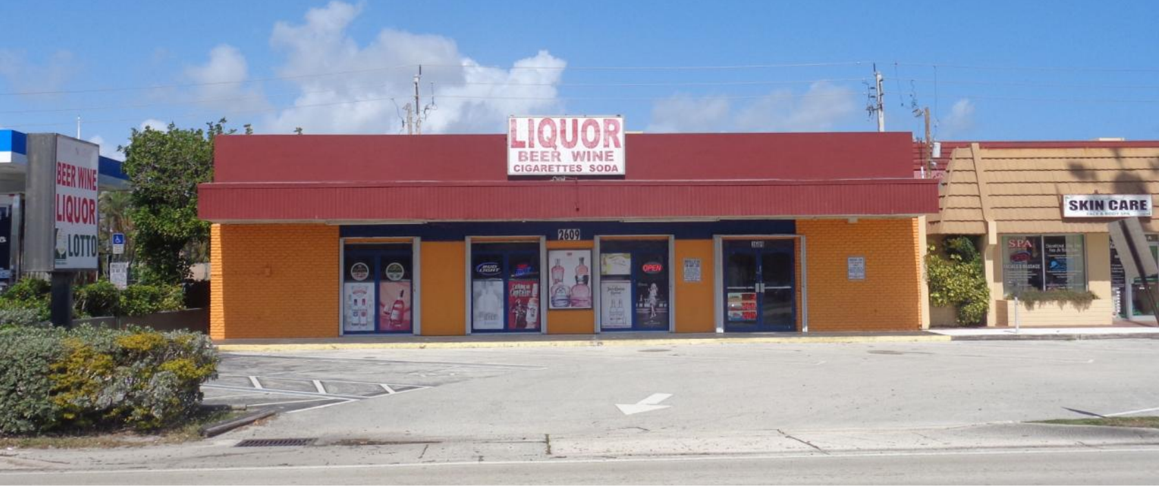
2609 East Commercial Blvd, Fort Lauderdale, FL 33308