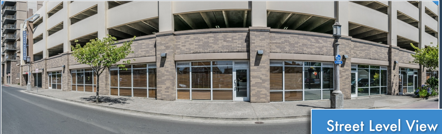
Street Level View