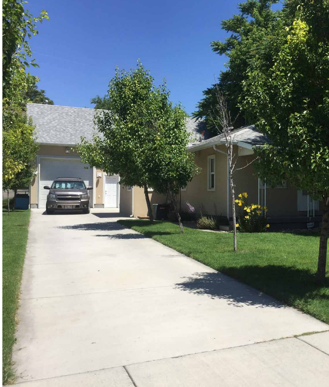
Home/Office and Rear Warehouse/ Shop Building