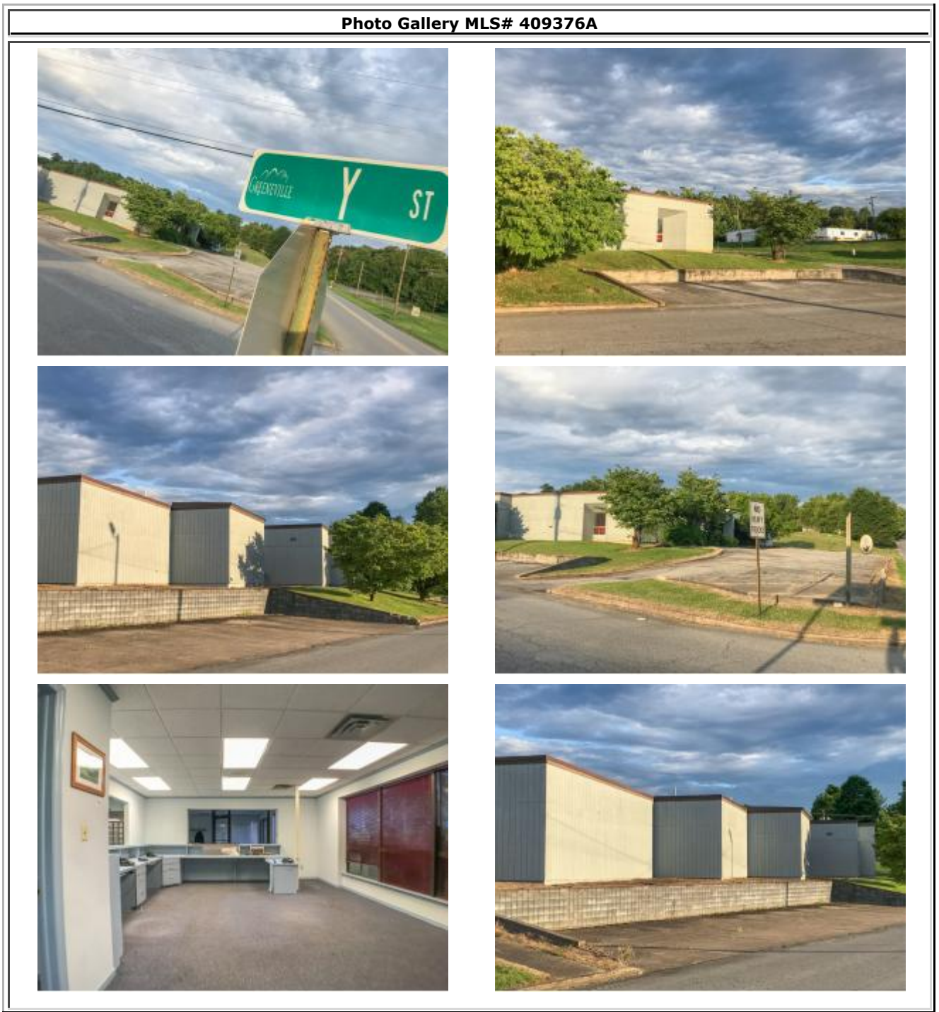
- - - - Information herein deemed reliable but not guaranteed - - - -Copyright Tenn/Va Regional MLS 07/08/2018 10:53 AM 2018