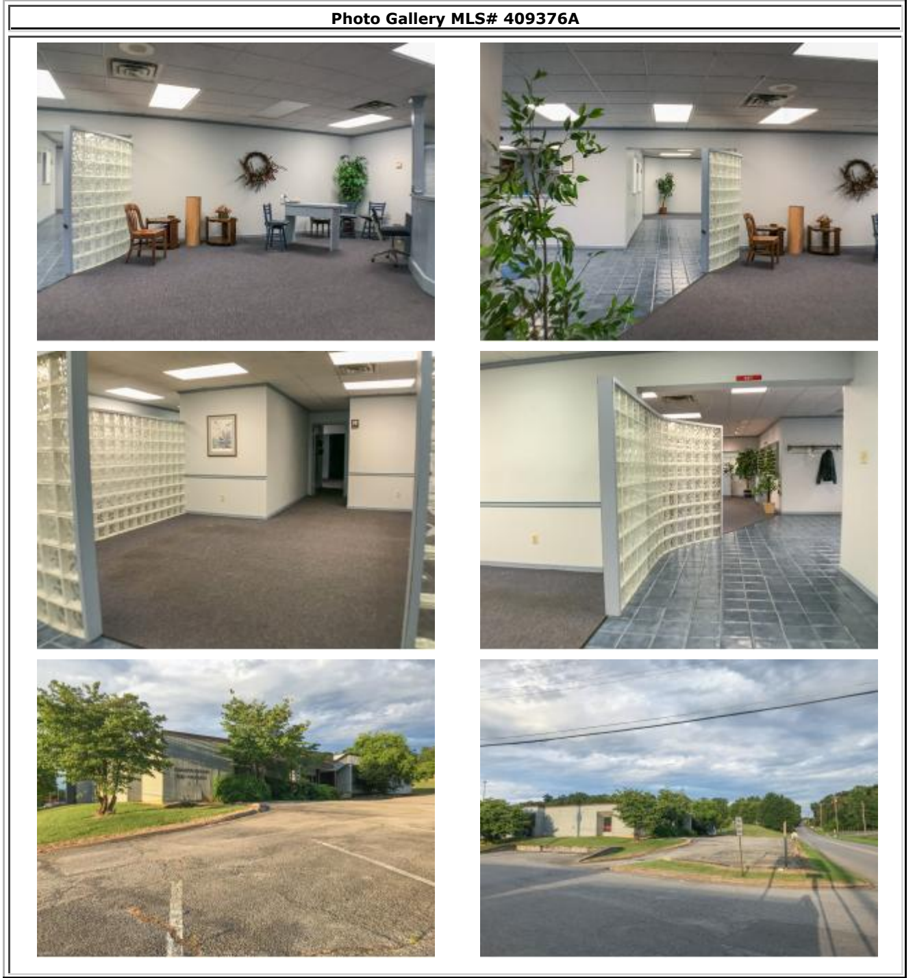
- - - - Information herein deemed reliable but not guaranteed - - - -Copyright Tenn/Va Regional MLS 07/08/2018 10:53 AM 2018