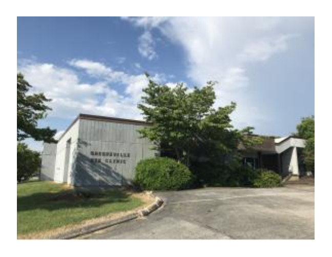
- - - Information herein deemed reliable but not guaranteed - -