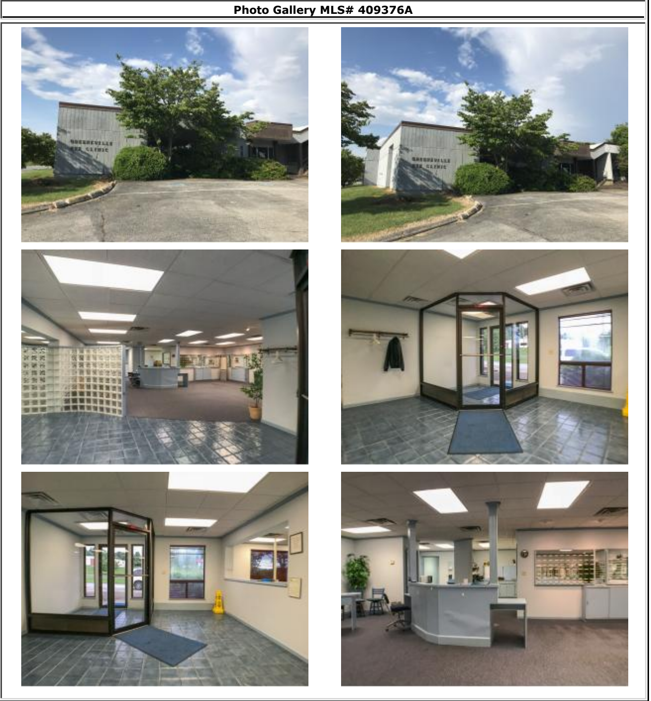
- - - - Information herein deemed reliable but not guaranteed - - - -Copyright Tenn/Va Regional MLS 07/08/2018 10:53 AM 2018