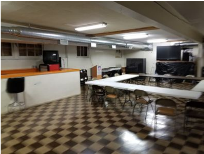
604 Oak basement 4