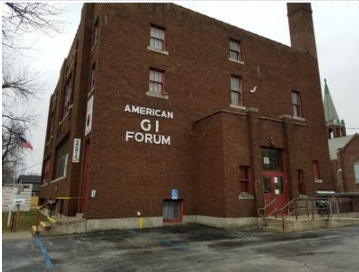
604 Oak rear