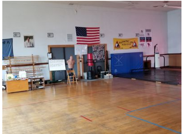
604 Oak 3rd floor gym