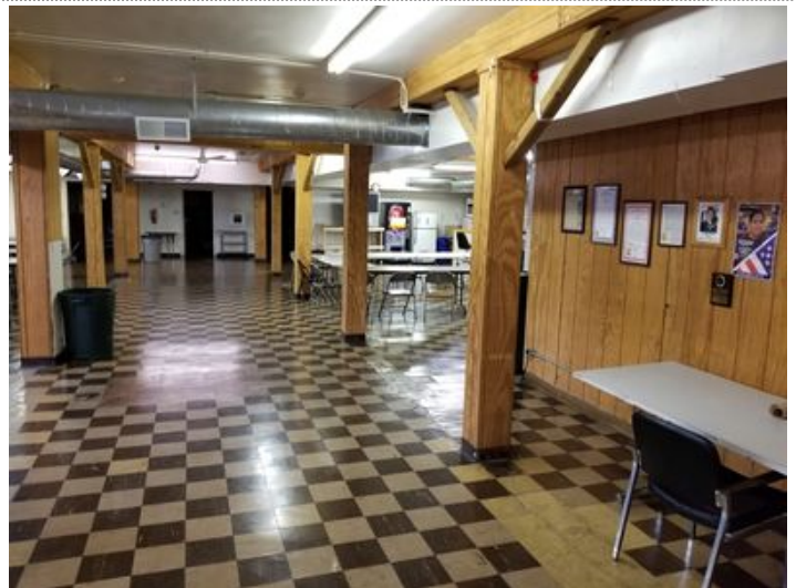
604 Oak Basement 1