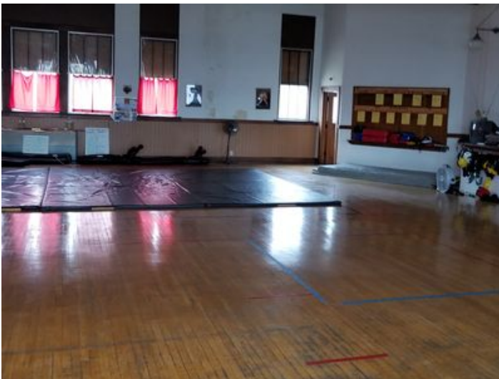
604 Oak Gym floor