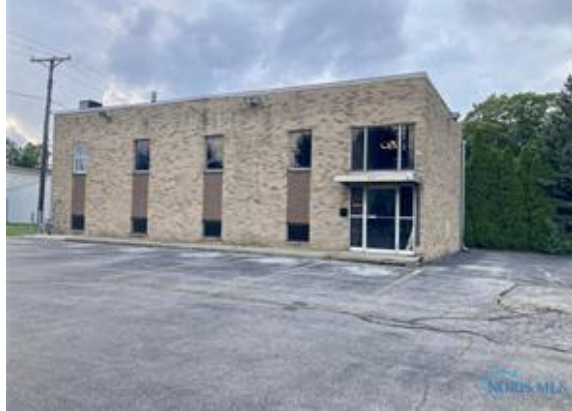
©2023 Northwest Ohio Realtors - Information herein deemed reliable but not guaranteed. Purchaser is responsible for Independently confirming all Information