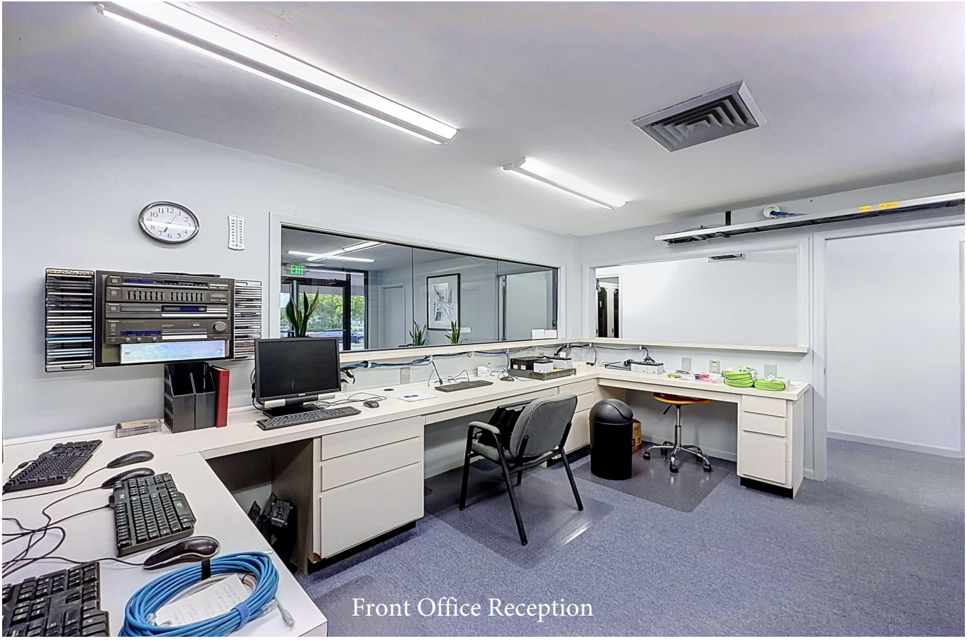
Front Office Reception