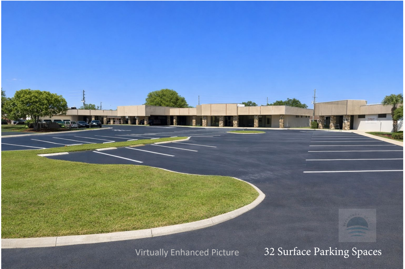
Virtually Enhanced Picture