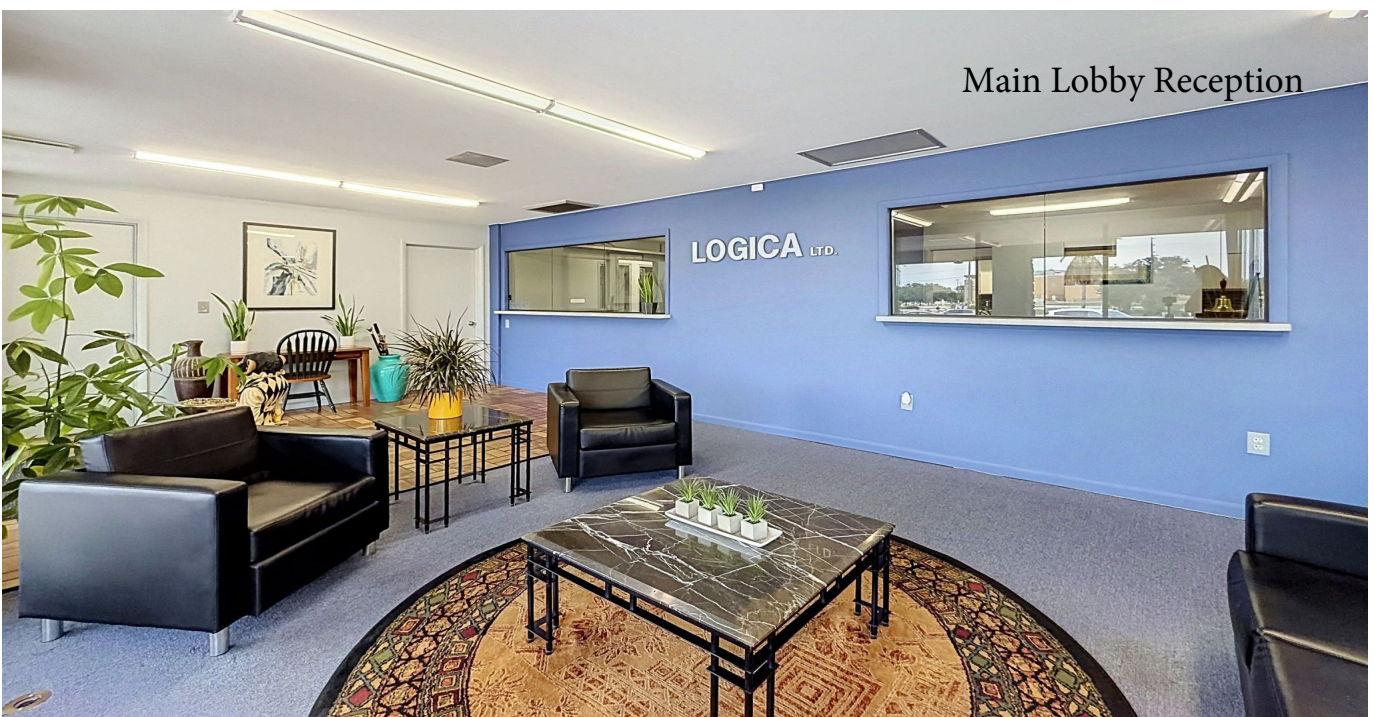
Main Lobby Reception