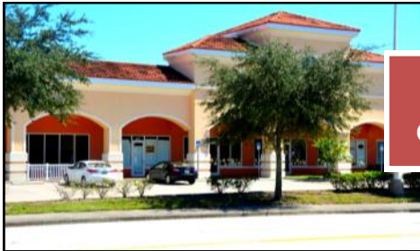
Class "A" Construction

For Lease 1,500 sq ft $17.00-19.50 psf/yr