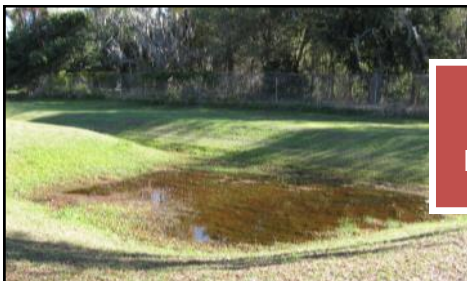
Well Kept Retention Ponds