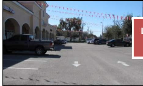
Large Parking Aisles