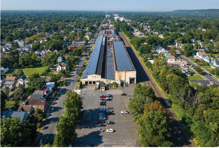
LOCATED IN PLAINFIELD, NJ