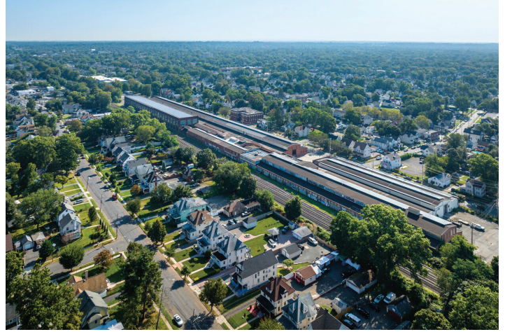
OFFERING RAIL ACCESS