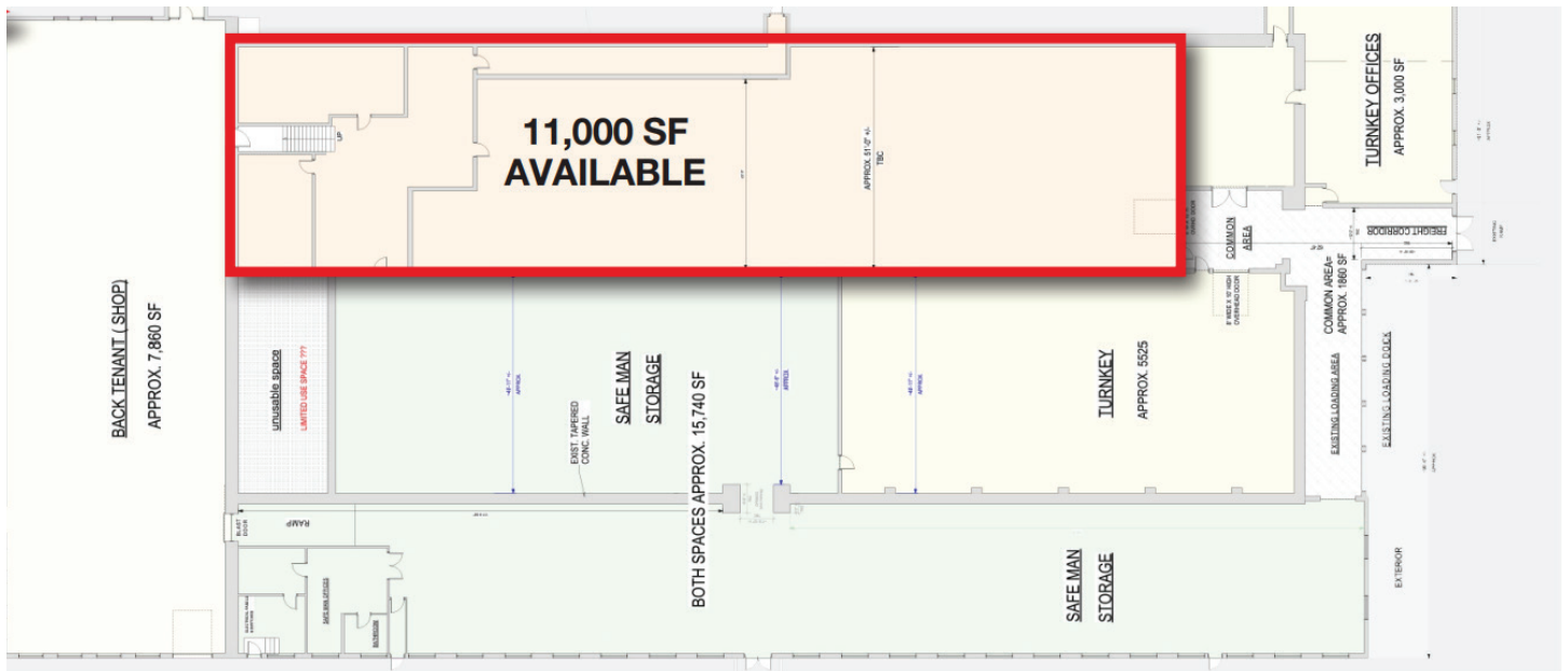
Floor Plan May Not Drawn to Scale