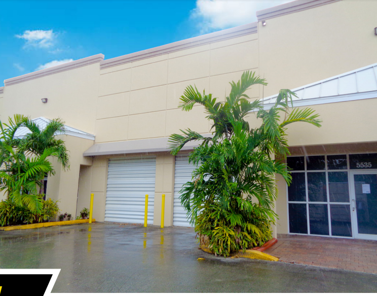
5539 N Nob Hill Rd, Sunrise, FL 33351