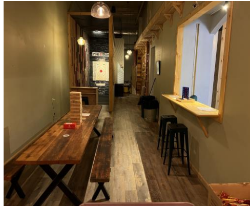
Eating / Entertainment Area