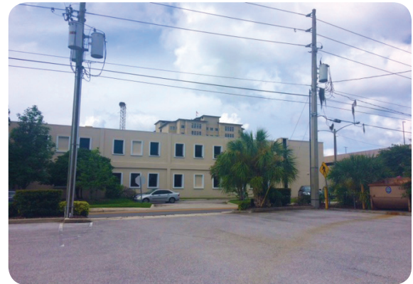
View of Sheriff's Office from parking lot

DISCLAIMER: Information contained herein is from sources deemed reliable, but not verified and no warranty is made as to the accuracy thereof. This offering is made subject to errors. Omissions, change of price or other conditions, prior sale or lease or withdrawal without notice. Prospective buyers/ tenants are encouraged to verify, independently, all pertinent data. The Mahoney Group, Inc. 3825 S. Florida Avenue, Suite 5, Lakeland, Florida 33813 is the agent of and represents the Owner/Landlord of this property.