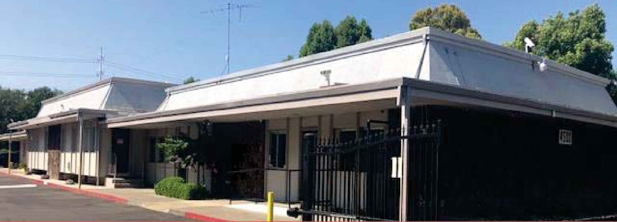
South Sacramento Medical Offices | 4500 47th Ave, Sacramento, CA, 95824