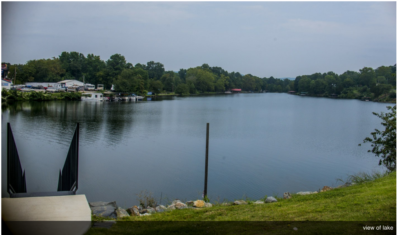
view of lake