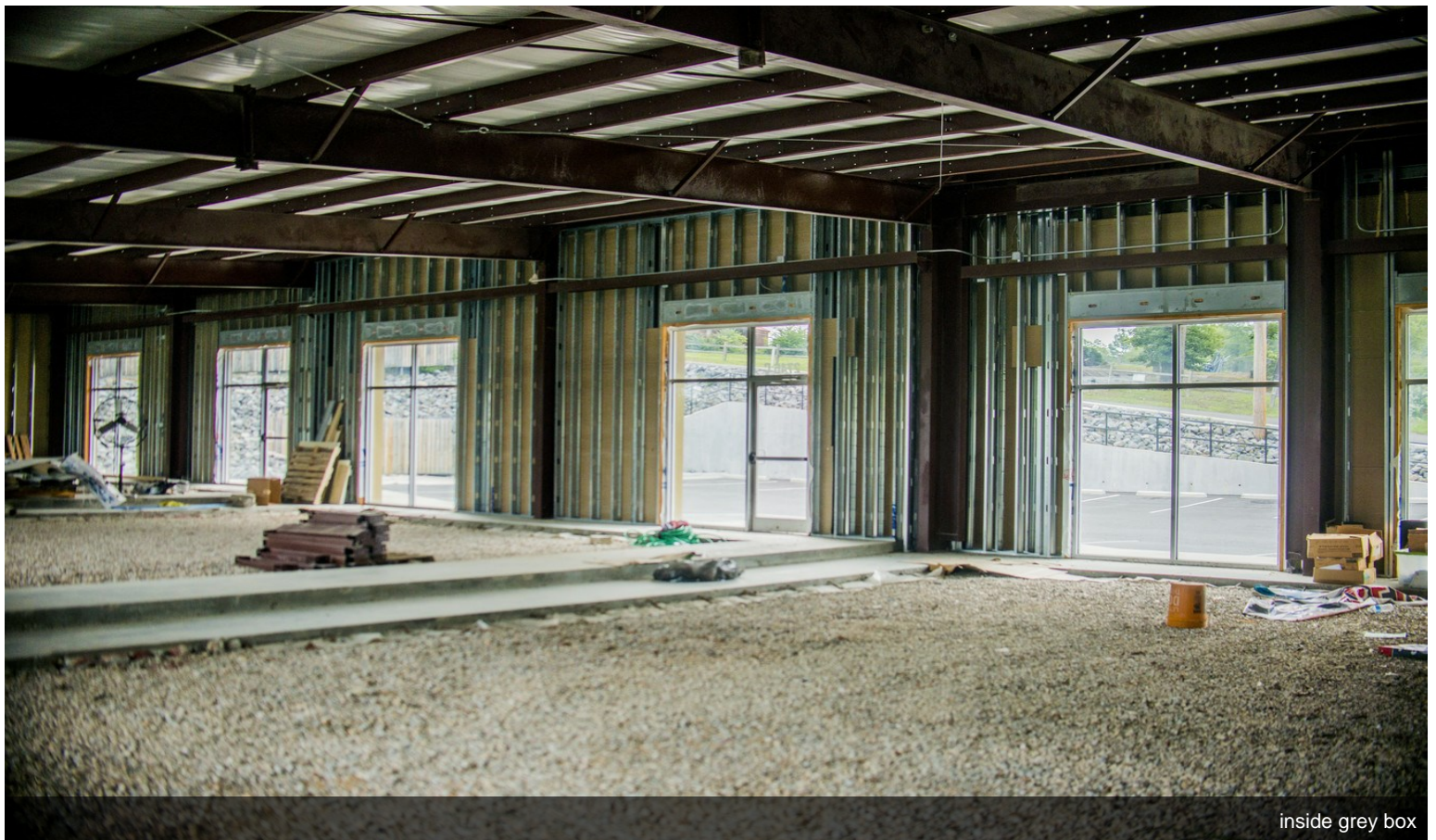
inside grey box