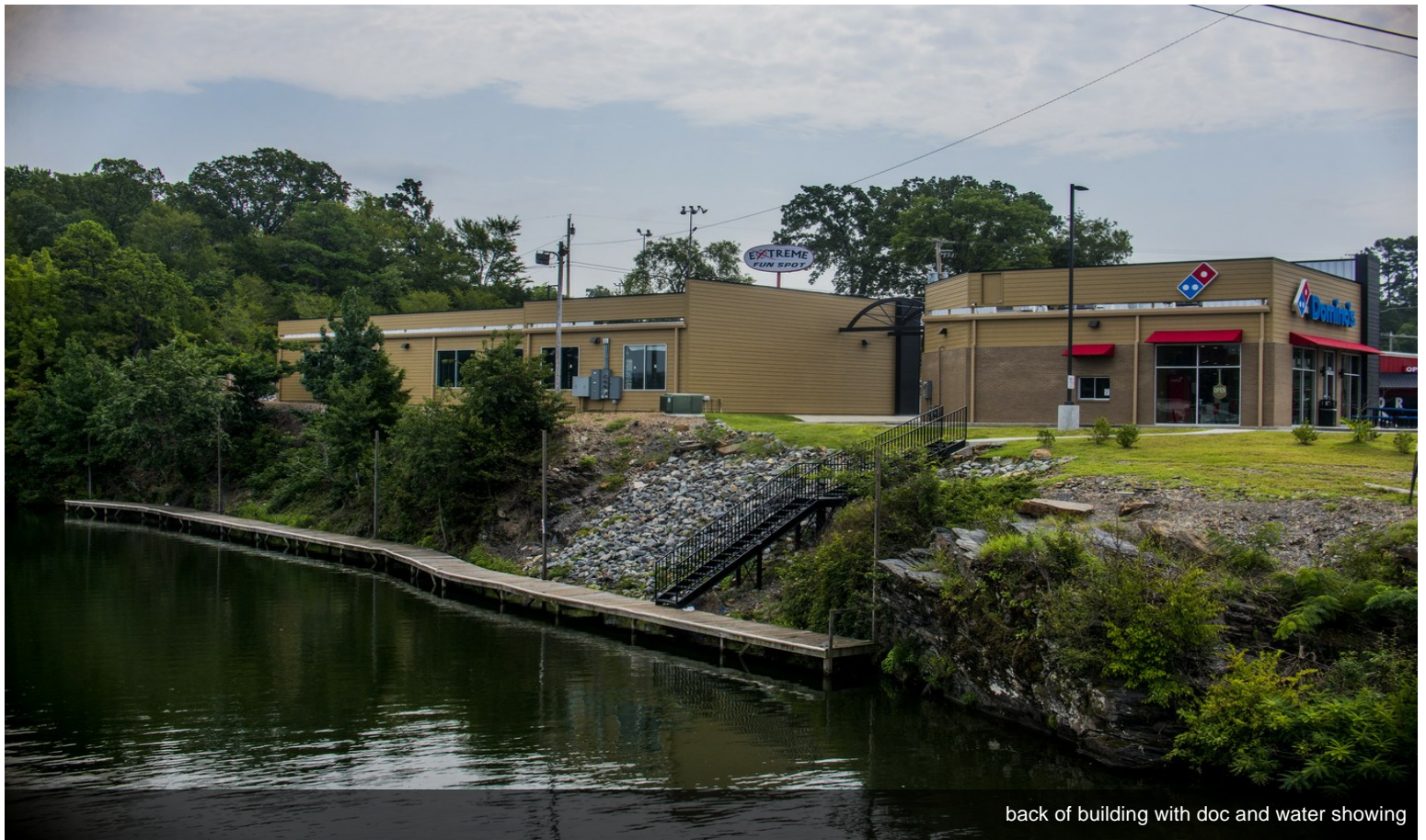
back of building with doc and water showing