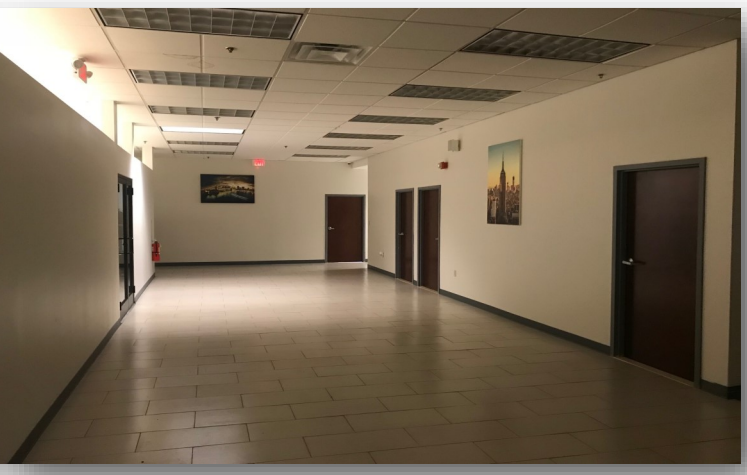
Additionally up to 10,000 SF Class A office available adjacent to warehouse. Terms negotiable.