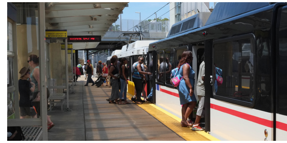
Forest Park-DeBaliviere Metro Station

Offering riders a convenient means of transport all throughout Delmar Blvd (called "One of America's 10 Great Streets" by American Planning Assoc., and into Forest Park, The Loop Trolley stops at stations including one that is a block away from the subject property.