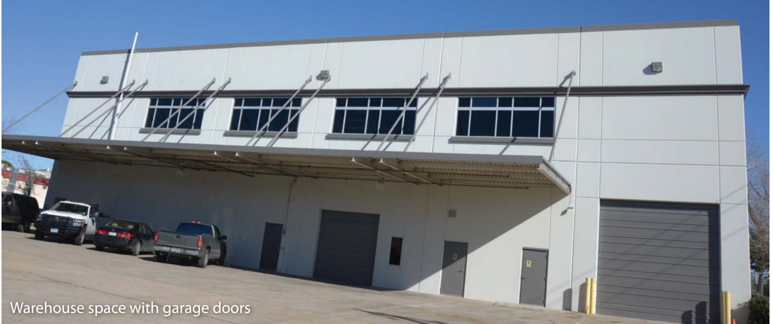
Warehouse space with garage doors