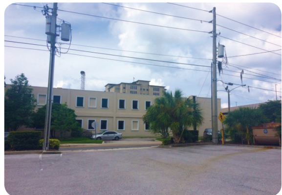
View of Sheriff's Office from parking lot

DISCLAIMER: Information contained herein is from sources deemed reliable, but not verified and no warranty is made as to the accuracy thereof. This offering is made subject to errors. Omissions, change of price or other conditions, prior sale or lease or withdrawal without notice. Prospective buyers/ tenants are encouraged to verify, independently, all pertinent data. The Mahoney Group, Inc. 3825 S. Florida Avenue, Suite 5, Lakeland, Florida 33813 is the agent of and represents the Owner/Landlord of this property.