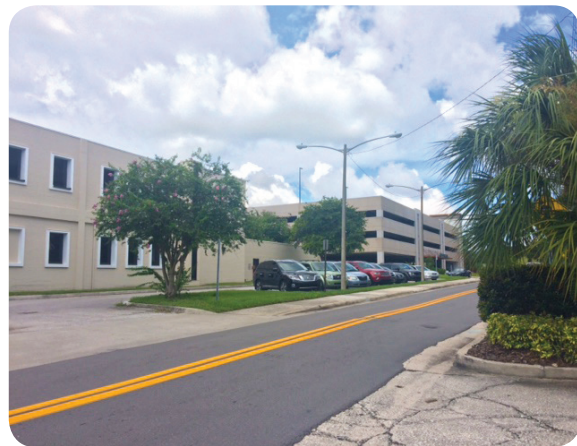
View towards County parking garage