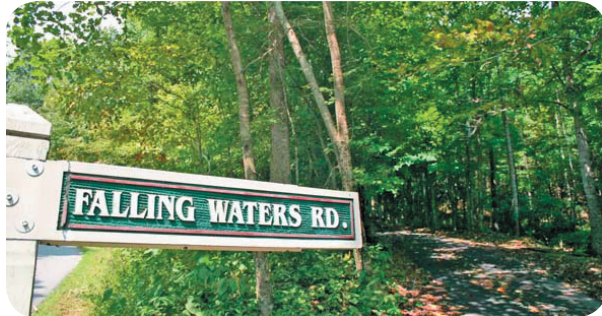
Tree-draped paved access to 95.7 acres