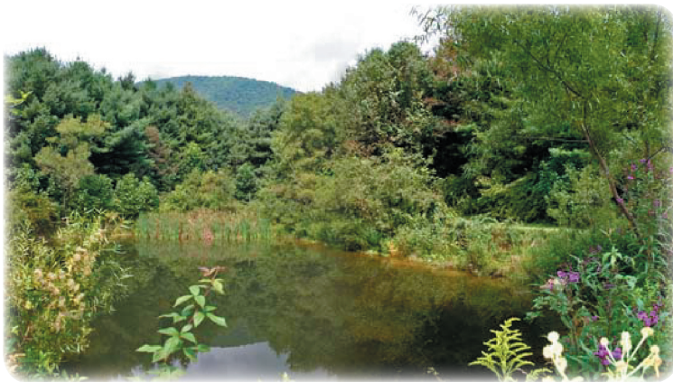
Natural pond, stream and springs