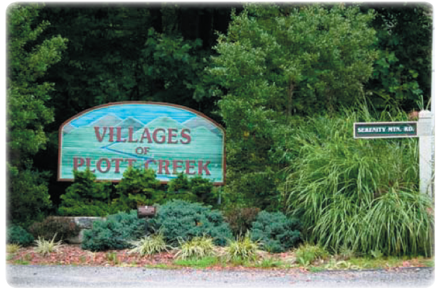
Enter this terrific investment property through Plott Creek