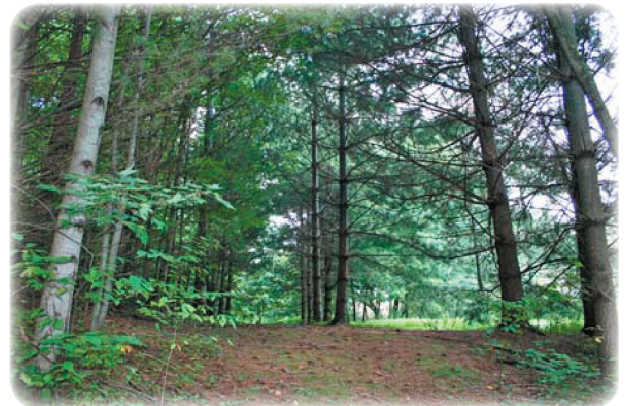
Beautiful home sites